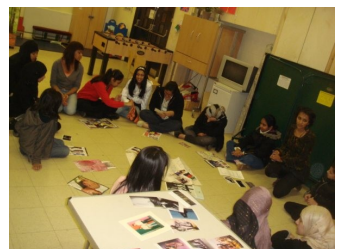
Photography Course –

Health & Fitness levels, understanding measures to improve Health and Fitness, basic nutrition for Health and setting achievable goals for healthier lifestyles. At the end of the course the group was taken to see a live premiersip match at the Chelsea Stadium. Also they came 3rd place in a recent borough football tournament.