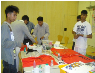
"Go Karting Sessions, Horse Riding & the Textiles Course were some of the fantastic Courses that were available"