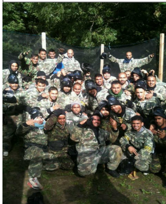
Paintballing Trip 2010

Kickboxing Mondays @ 6pm in Marner Centre